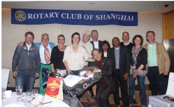
Visitors from the Netherland

Contributions raised: Rmb 4,000 ( 666 Rmb/table )